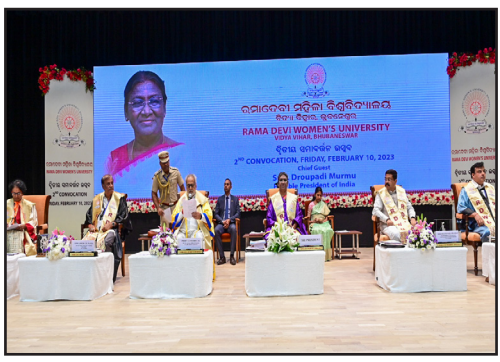
Hon'ble President with honoured guests on dias