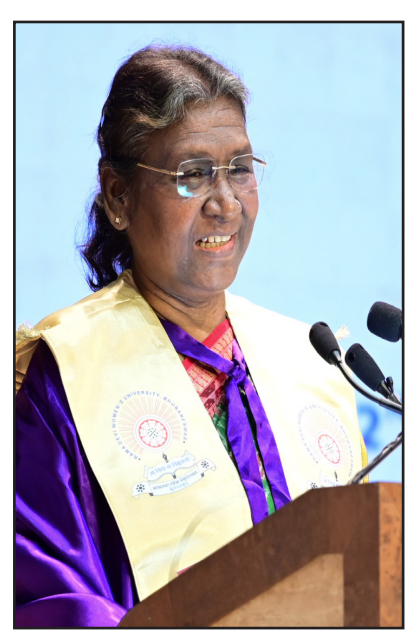
Hon'ble President reminisces on her undergraduate days