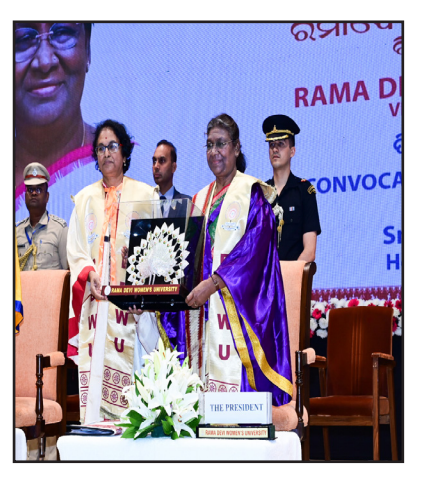
The Vice-Chancellor bestows a present to India's first President