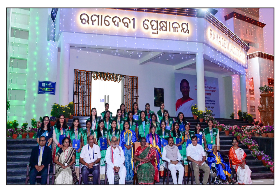
Hon'ble President, Smt. Droupadi Murmu with Top Achievers