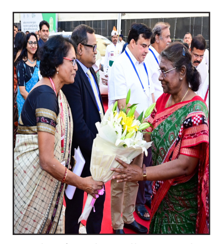
The Vice-Chancellor extends acordial greeting to the President